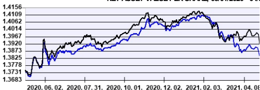
NET ASSET VALUE PER SHARE, 05/01/2020 - 04/30/2021

— Aegon Polish Bond Fund institutional series — Benchmark