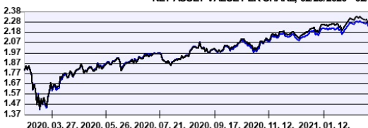
NET ASSET VALUE PER SHARE, 02/29/2020 - 02/28/2021

— Aegon International Equity Fund institutional series — Benchmark