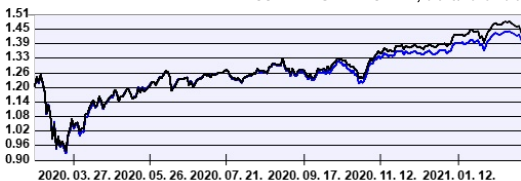
NET ASSET VALUE PER SHARE, 02/29/2020 - 02/28/2021

— Aegon International Equity Fund EUR series — Benchmark