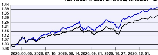
NET ASSET VALUE PER SHARE, 05/19/2020 - 12/31/2020

— Aegon MegaTrend Equity Fund of Funds USD series — Benchmark