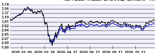
NET ASSET VALUE PER SHARE, 12/01/2019 - 11/30/2020

— Aegon Russia Equity Fund HUF series — Benchmark