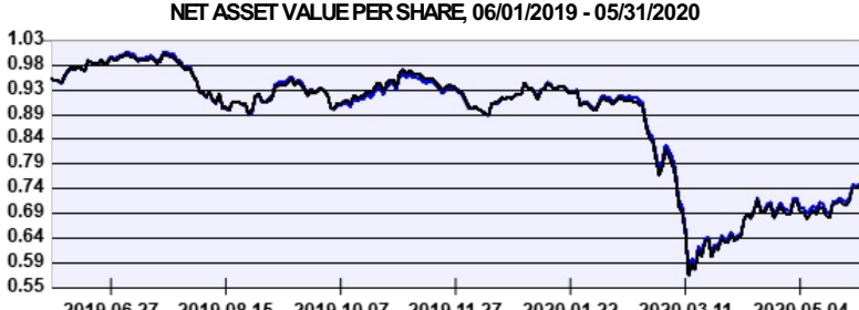
NET ASSET VALUE PER SHARE, 06/01/2019 - 05/31/2020

--- Aegon Polish Equity Fund PLN series --- Benchmark