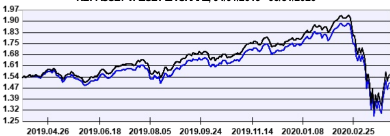
NET ASSET VALUE PER SHARE, 04/01/2019 - 03/31/2020

— Aegon International Equity Fund HUF series — Benchmark