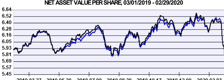
NET ASSET VALUE PER SHARE, 03/01/2019 - 02/29/2020

— Aegon Central European Equity Fund institutional series — Benchmark