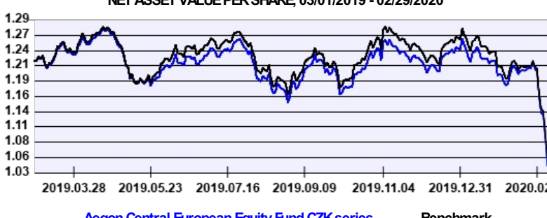
NET ASSET VALUE PER SHARE, 03/01/2019 - 02/29/2020

---- Aegon Central European Equity Fund CZK series ---- Benchmark