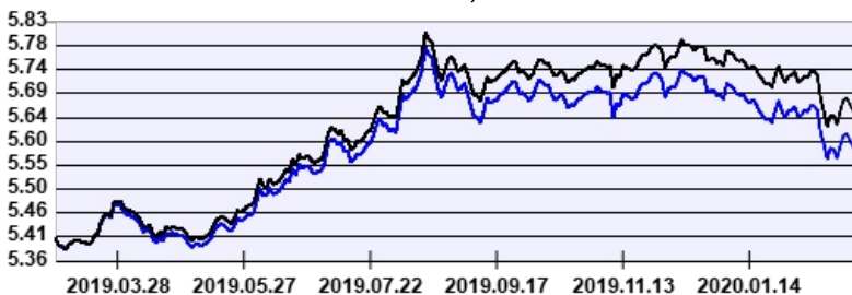
NET ASSET VALUE PER SHARE, 03/01/2019 - 02/29/2020

— Aegon Domestic Bond Fund HUF series — Benchmark