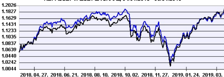
NET ASSET VALUE PER SHARE, 04/01/2018 - 03/31/2019

— Aegon International Equity Fund EUR series — Benchmark