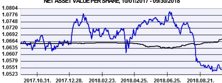
NET ASSET VALUE PER SHARE, 10/01/2017 - 09/30/2018

— Aegon Alfa Total Return Investment Fund institutional series — Benchmark