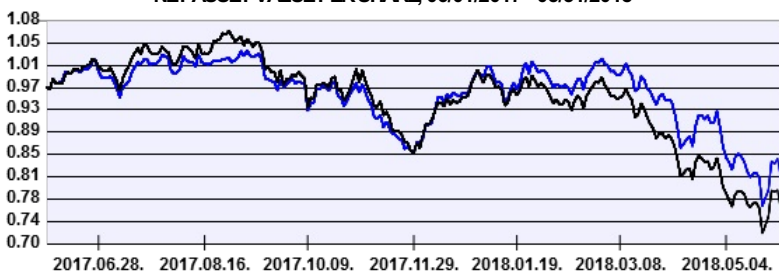
NET ASSET VALUE PER SHARE, 06/01/2017 - 05/31/2018

— Aegon Istanbul Equity Fund PLN series — Benchmark