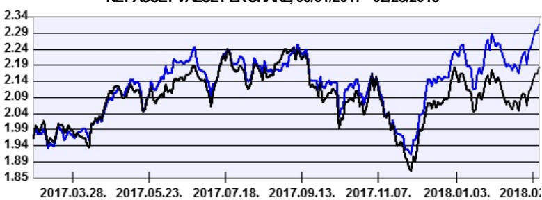
NET ASSET VALUE PER SHARE, 03/01/2017 - 02/28/2018

— Aegon Istanbul Equity Fund HUF series — Benchmark