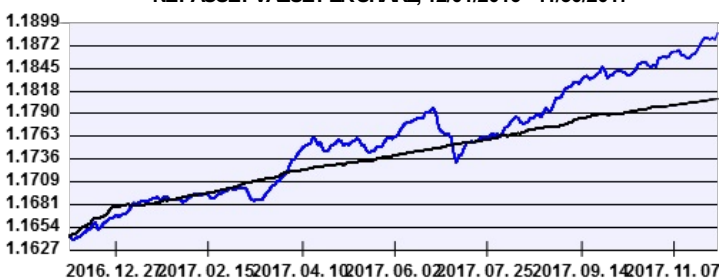
NET ASSET VALUE PER SHARE, 12/01/2016 - 11/30/2017

--- Aegon BondMaxx Total Return Bond Investment Fund R series --- Benchmark Past performance is no guarantee of future results. This report should not be considered as an offer or investment advisory. The Fund Prospectus contains the detailed conditions of the investment. The distribution costs of the fund purchase can be found at the distributors.