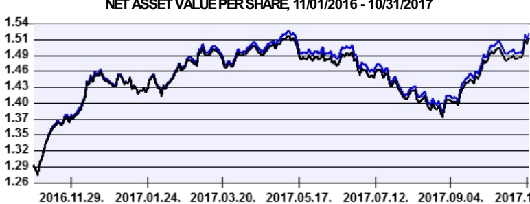
NET ASSET VALUE PER SHARE, 11/01/2016 - 10/31/2017

— Aegon International Equity Fund institutional series — Benchmark