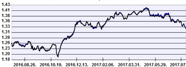
NET ASSET VALUE PER SHARE, 08/01/2016 - 07/31/2017

— Aegon International Equity Fund HUF series — Benchmark