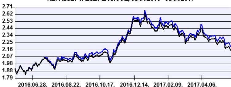
NET ASSET VALUE PER SHARE, 06/01/2016 - 05/31/2017

— Aegon Russia Equity Fund institutional series — Benchmark