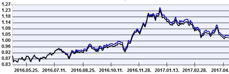
NET ASSET VALUE PER SHARE, 05/01/2016 - 04/30/2017

— Aegon Russia Equity Fund PI series — Benchmark