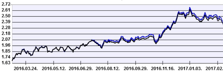
NET ASSET VALUE PER SHARE, 02/29/2016 - 02/28/2017

— Aegon Russia Equity Fund institutional series — Benchmark