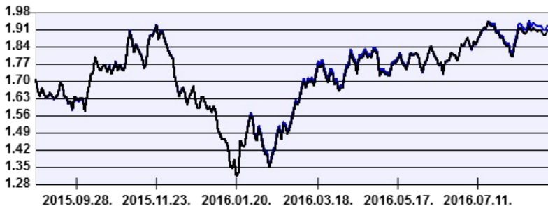
NET ASSET VALUE PER SHARE, 09/01/2015 - 08/31/2016

— Aegon Russia Equity Fund HUF series — Benchmark