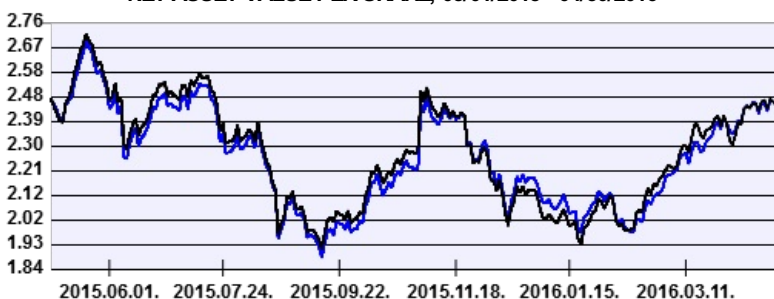
NET ASSET VALUE PER SHARE, 05/01/2015 - 04/30/2016

— Aegon IstanBull Equity Fund institutional series — Benchmark