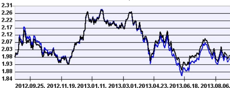
NET ASSET VALUE PER SHARE, 09/01/2012 - 08/31/2013

— AEGON Russia Equity Fund HUF series — Benchmark