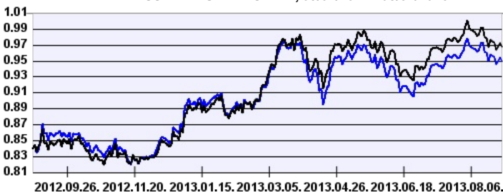
NET ASSET VALUE PER SHARE, 09/01/2012 - 08/31/2013

--- AEGON International Equity Fund HUF series --- Benchmark