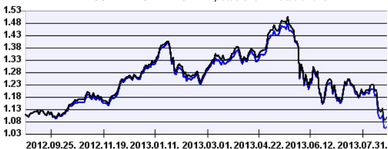
NET ASSET VALUE PER SHARE, 09/01/2012 - 08/31/2013

— AEGON IstanBull Equity Fund TRY series — Benchmark