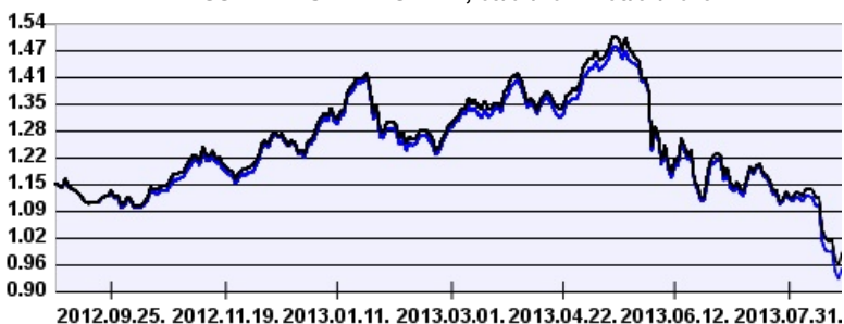
NET ASSET VALUE PER SHARE, 09/01/2012 - 08/31/2013

— AEGON IstanBull Equity Fund PLN series — Benchmark