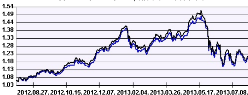
NET ASSET VALUE PER SHARE, 08/01/2012 - 07/31/2013

— AEGON IstanBull Equity Fund TRY series — Benchmark