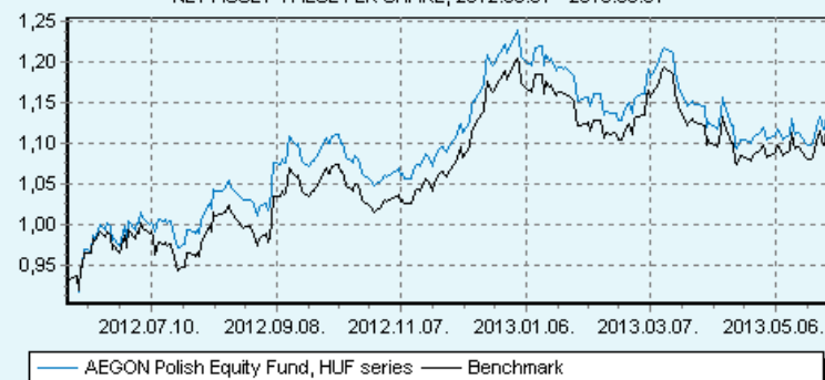
NET ASSET VALUE PER SHARE, 2012.06.01 - 2013.05.31

Past performance is no guarantee of future results. This report should not be considered as an offer or investment advisory. The Fund Prospectus contains the detailed conditions of the investment. The distribution costs of the fund purchase can be found at the distributors.