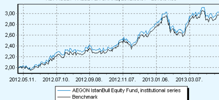
NET ASSET VALUE PER SHARE, 2012.05.01 - 2013.04.30

Past performance is no guarantee of future results. This report should not be considered as an offer or investment advisory. The Fund Prospectus contains the detailed conditions of the investment. The distribution costs of the fund purchase can be found at the distributors.