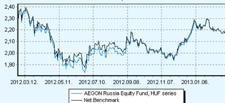
NET ASSET VALUE PER SHARE, 2012.02.29 - 2013.02.28

Past performance is no guarantee of future results. This report should not be considered as an offer or investment advisory. The Fund Prospectus contains the detailed conditions of the investment. The distribution costs of the fund purchase can be found at the distributors.