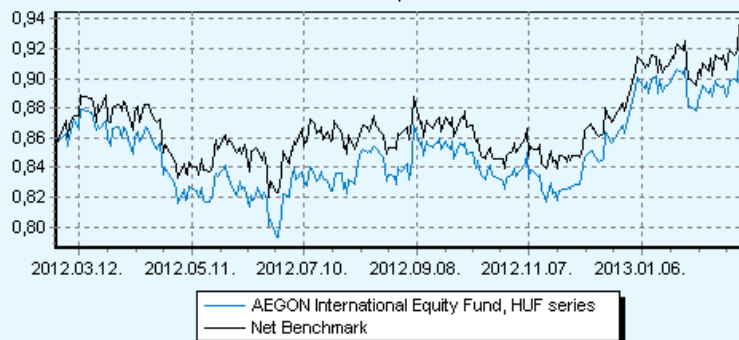
NET ASSET VALUE PER SHARE, 2012.02.29 - 2013.02.28

Past performance is no guarantee of future results. This report should not be considered as an offer or investment advisory. The Fund Prospectus contains the detailed conditions of the investment. The distribution costs of the fund purchase can be found at the distributors.