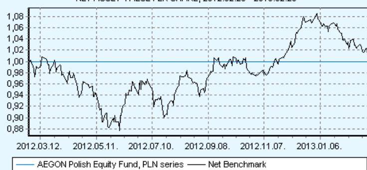
NET ASSET VALUE PER SHARE, 2012.02.29 - 2013.02.28

Past performance is no guarantee of future results. This report should not be considered as an offer or investment advisory. The Fund Prospectus contains the detailed conditions of the investment. The distribution costs of the fund purchase can be found at the distributors.