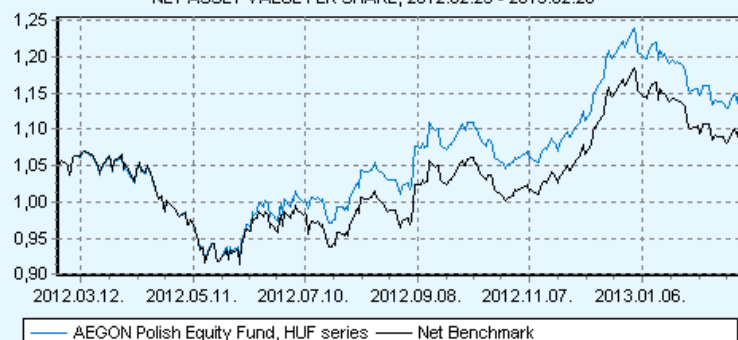
NET ASSET VALUE PER SHARE, 2012.02.29 - 2013.02.28

Past performance is no guarantee of future results. This report should not be considered as an offer or investment advisory. The Fund Prospectus contains the detailed conditions of the investment. The distribution costs of the fund purchase can be found at the distributors.