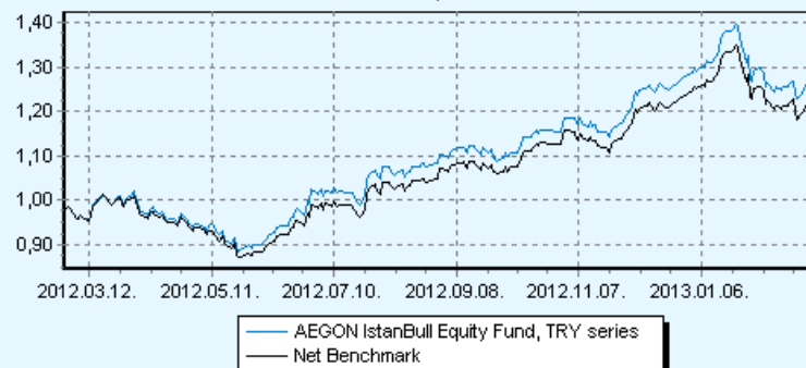
NET ASSET VALUE PER SHARE, 2012.02.29 - 2013.02.28

Past performance is no guarantee of future results. This report should not be considered as an offer or investment advisory. The Fund Prospectus contains the detailed conditions of the investment. The distribution costs of the fund purchase can be found at the distributors.