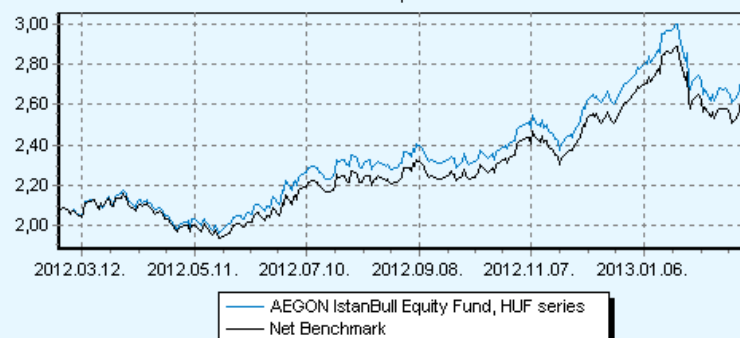
NET ASSET VALUE PER SHARE, 2012.02.29 - 2013.02.28

Past performance is no guarantee of future results. This report should not be considered as an offer or investment advisory. The Fund Prospectus contains the detailed conditions of the investment. The distribution costs of the fund purchase can be found at the distributors.