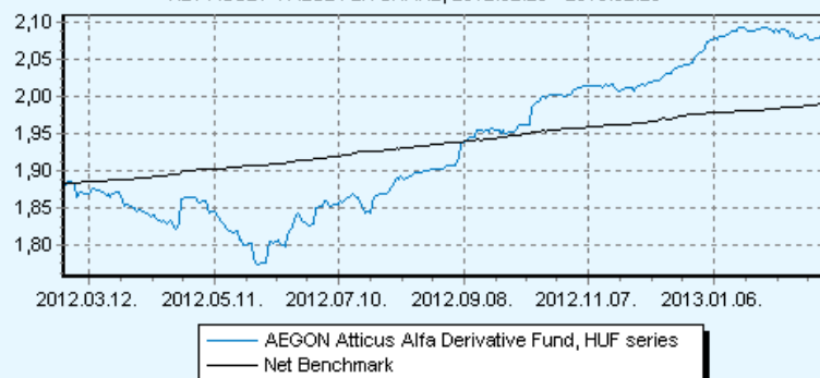
NET ASSET VALUE PER SHARE, 2012.02.29 - 2013.02.28

Past performance is no guarantee of future results. This report should not be considered as an offer or investment advisory. The Fund Prospectus contains the detailed conditions of the investment. The distribution costs of the fund purchase can be found at the distributors.