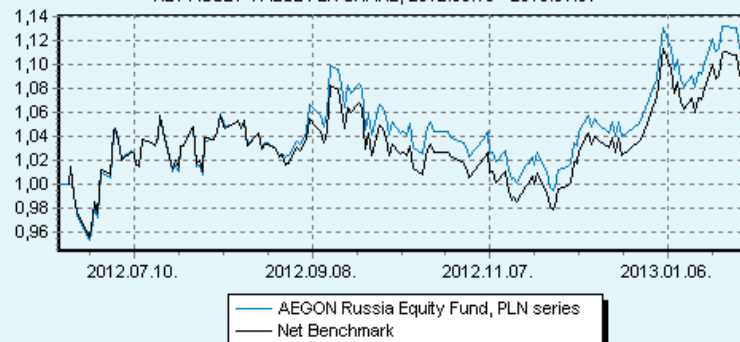
NET ASSET VALUE PER SHARE, 2012.06.15 - 2013.01.31

Past performance is no guarantee of future results. This report should not be considered as an offer or investment advisory. The Fund Prospectus contains the detailed conditions of the investment. The distribution costs of the fund purchase can be found at the distributors.