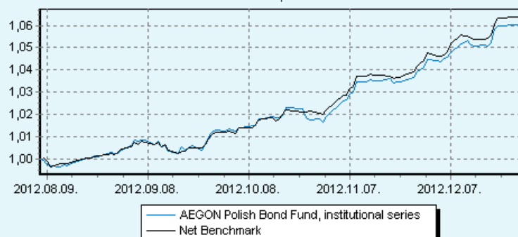
NET ASSET VALUE PER SHARE, 2012.08.07 - 2012.12.31

Past performance is no guarantee of future results. This report should not be considered as an offer or investment advisory. The Fund Prospectus contains the detailed conditions of the investment. The distribution costs of the fund purchase can be found at the distributors.