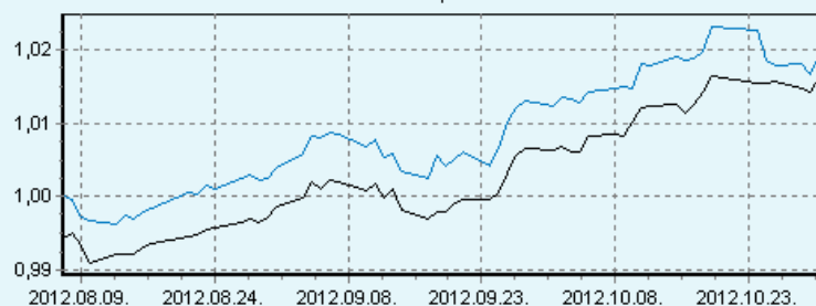
NET ASSET VALUE PER SHARE, 2012.08.07 - 2012.10.31

— AEGON Polish Bond Fund, institutional series — Net Benchmark