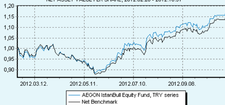
NET ASSET VALUE PER SHARE, 2012.02.20 - 2012.10.31

Past performance is no guarantee of future results. This report should not be considered as an offer or investment advisory. The Fund Prospectus contains the detailed conditions of the investment. The distribution costs of the fund purchase can be found at the distributors.