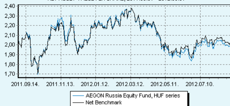
NET ASSET VALUE PER SHARE, 2011.09.01 - 2012.08.31

Past performance is no guarantee of future results. This report should not be considered as an offer or investment advisory. The Fund Prospectus contains the detailed conditions of the investment. The distribution costs of the fund purchase can be found at the distributors.