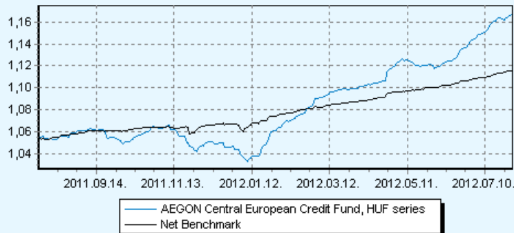
NET ASSET VALUE PER SHARE, 2011.08.01 - 2012.07.31

Past performance is no guarantee of future results. This report should not be considered as an offer or investment advisory. The Fund Prospectus contains the detailed conditions of the investment. The distribution costs of the fund purchase can be found at the distributors.