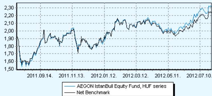
NET ASSET VALUE PER SHARE, 2011.08.01 - 2012.07.31

Past performance is no guarantee of future results. This report should not be considered as an offer or investment advisory. The Fund Prospectus contains the detailed conditions of the investment. The distribution costs of the fund purchase can be found at the distributors.