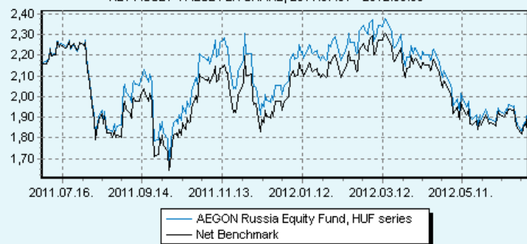
NET ASSET VALUE PER SHARE, 2011.07.01 - 2012.06.30

Past performance is no guarantee of future results. This report should not be considered as an offer or investment advisory. The Fund Prospectus contains the detailed conditions of the investment. The distribution costs of the fund purchase can be found at the distributors.