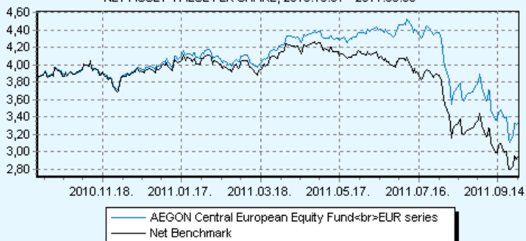
NET ASSET VALUE PER SHARE, 2010.10.01 - 2011.09.30

Past performance is no guarantee of future results. This report should not be considered as an offer or investment advisory. The Fund Prospectus contains the detailed conditions of the investment. The distribution costs of the fund purchase can be found at the distributors.