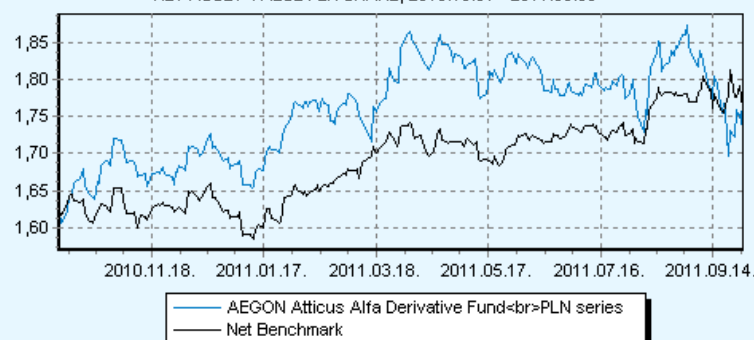
NET ASSET VALUE PER SHARE, 2010.10.01 - 2011.09.30

Past performance is no guarantee of future results. This report should not be considered as an offer or investment advisory. The Fund Prospectus contains the detailed conditions of the investment. The distribution costs of the fund purchase can be found at the distributors.