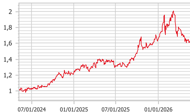
net asset value per share, 05/07/2024 - 05/31/2026