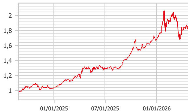
net asset value per share, 08/29/2024 - 04/30/2026