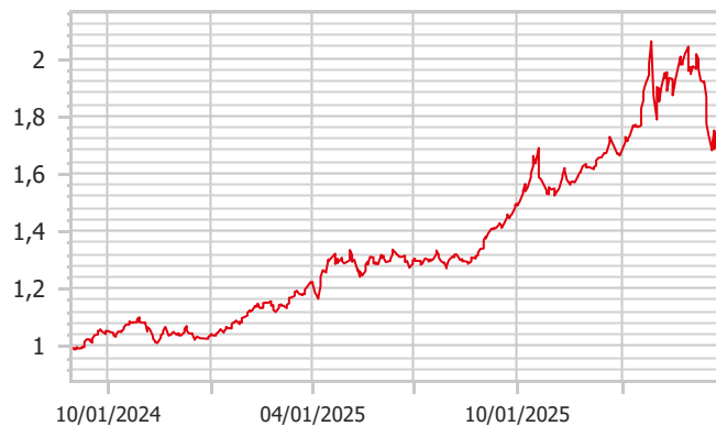
net asset value per share, 08/29/2024 - 03/31/2026