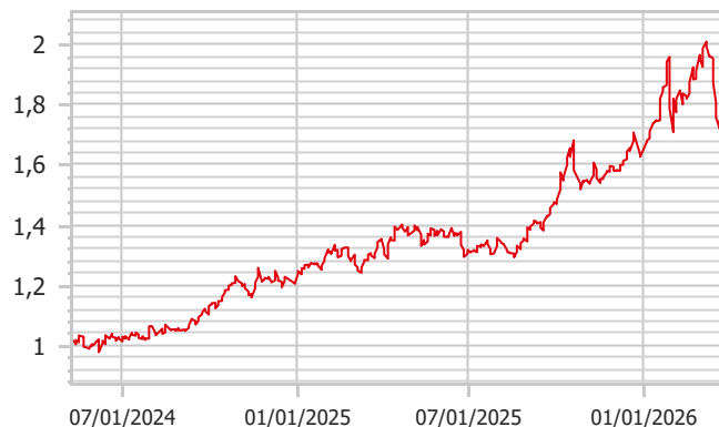
net asset value per share, 05/07/2024 - 03/31/2026